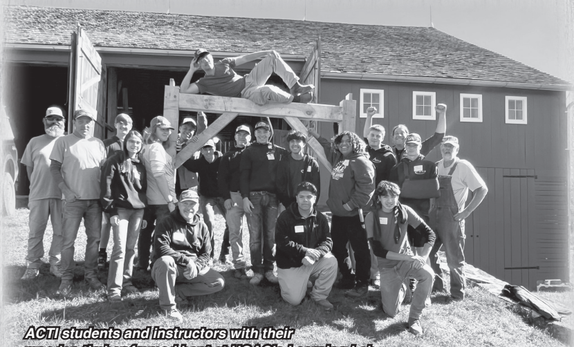
ACTI students and instructors with their wooden timber-framed bent at HGAC's Learning Lab.