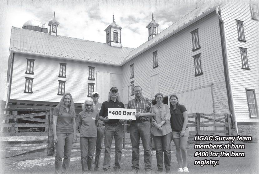
HGAC Survey team members at barn #400 for the barn registry.